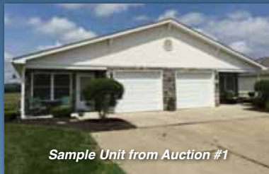
Sample Unit from Auction #1

REALTOR Participation: Commission available to Ohio Licensee representing a successful bidder who closes on transaction. To collect a commission, Realtor's must: 1) Register your bidder no less than 48 hours prior to auction; 2) Accompany your client to a scheduled inspection; 3) Accompany your client to the auction; 4) Guide buyer to closing. NOTE: If bidding online, you must register your client prior to their registering online. Disclaimer: Information contained herein was obtained from sources deemed reliable. However, neither Ohio Real Estate Auctions, LLC, Auctioneers nor their agents will be responsible for any errors or omissions regarding information provided by same. Announcements made at the auction will take precedence over written material or any other statements made prior to the auction. Buyers should carefully verify all information and make their own decision as to the accuracy thereof before relying on same.