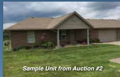
Sample Unit from Auction #2