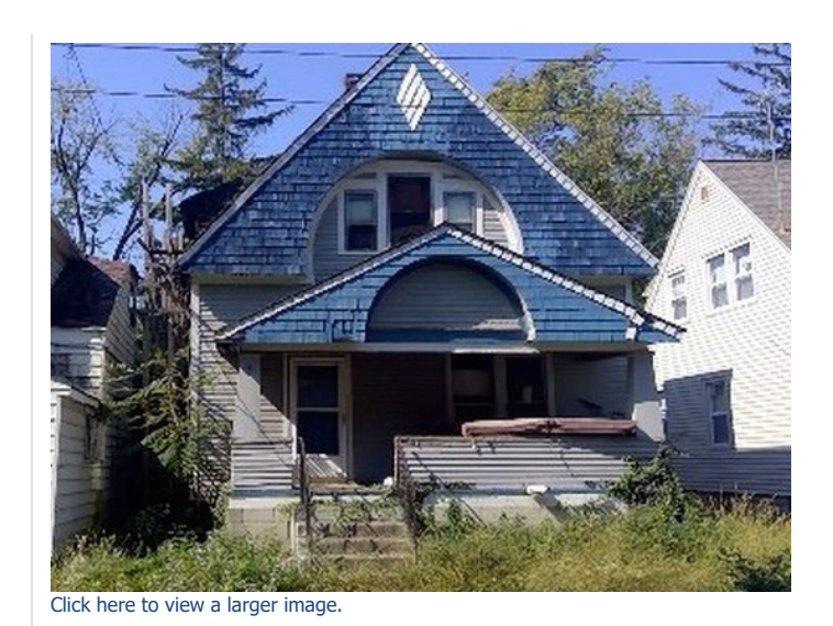
The CAMA data presented on this website is current as of 7/18/2024 6:03:47 AM.