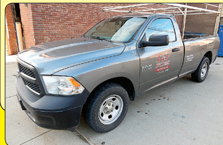
2013 Dodge Ram Pick Up Truck

Sterling/Terex Crane Truck • Ford Semi Tractor • Dump Trailers • Drop Deck Trailer • Fork Lifts • Pick Up Trucks Miscellaneous Trailers • Mustang Skid Steer • Tar Kettles • Tear Off Machines • Roofing Items Roofing Materials, Adhesives, Supplies, Etc. • Roll Former Model VS-150 Roof Panel Former Cellufoam Machine • Welders • Generators • Niagara 10' X 14 Gauge Power Squaring Shear Turn-N-Bend 10' Power Brake • Tennsmith Brakes • Miscellaneous Sheet Metal Machinery Sheet Metal and Stainless Stock, Large Quantity • Huge Quantity Power Tools and Support Items Real Estate Offered at Approx. 1 PM, Subject to Confirmation of Secured Lender