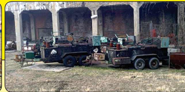
Bank View of Tar Kettle