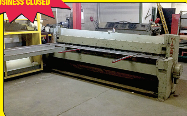
Niagara 10' X 14 Gauge Power Shear

WELL-EQUIPPED ROOFING CONTRACTOR COMPLETE LIQUIDATION BUSINESS CLOSED