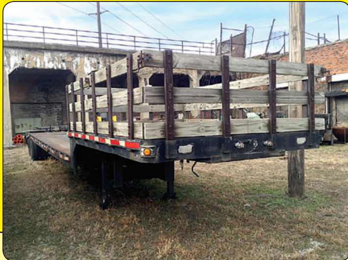
Transcraft Semi Trailer