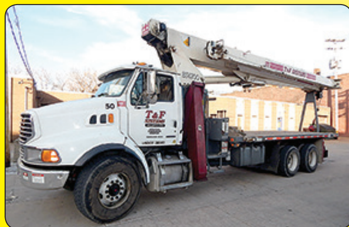
Sterling/Terex Crane Truck

T&F SYSTEMS, INC. 1599 E. 40th Street • Cleveland, Ohio Thursday, June 16 • 9:00 a.m.