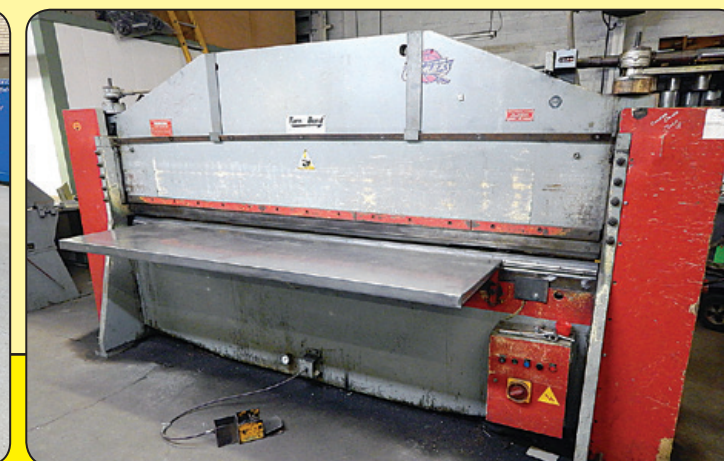
Turn-N-Bend Sheet Metal Brake

DIRECTIONS: From I-90 on East Side of Downtown Cleveland, Take Exit 173C, Superior Ave. Go East on Superior Ave. 1/2 Mile to E. 40th St. Turn Right onto E. 40th St., Auction Site 2/10 Mile on Left Hand Side, 1599 E. 40th St. Watch for Signs!