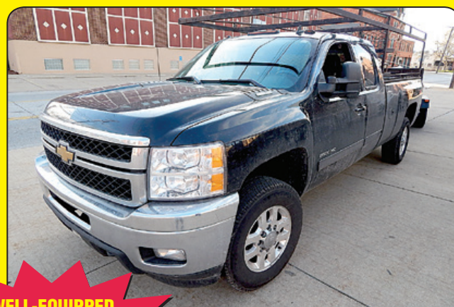
2011 Chevrolet Silverado Pick Up Truck