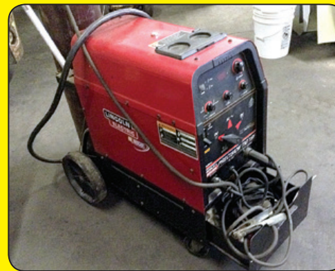
Lincoln Tig 185 Welder