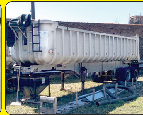
Freuhauf Dump Trailer (1 of 2)