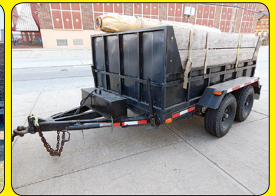
Spar Trailer (Several Available)