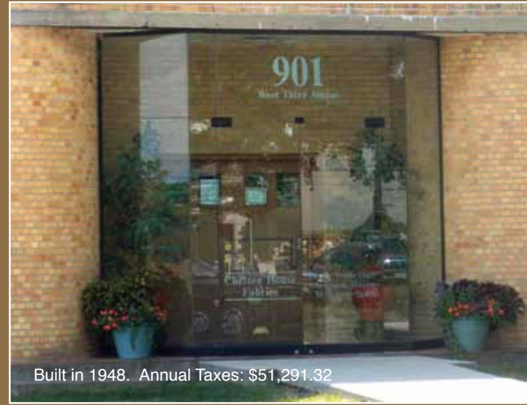
Built in 1948. Annual Taxes: $51,291.32

ONLINE-ONLY SEALED BID AUCTION Bidding Ends Thursday, October 11 th at 12pm